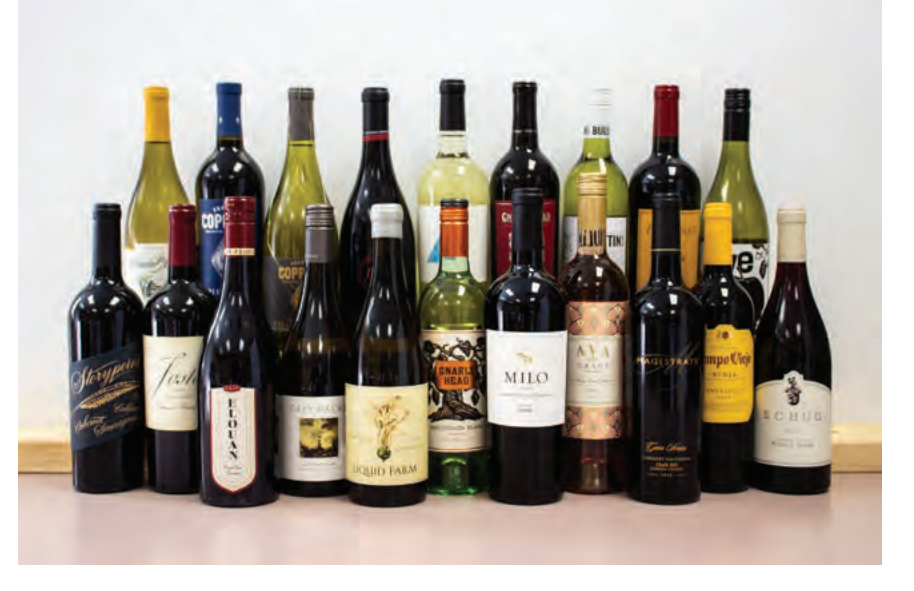
Wine Raffle package includes an assortment of wine donated by CABVI Board and Committee Members.

Bourbon Raffle package includes: Blanton's Single Barrel; Elmer T. Lee Single Barrel Sour Mash; Weller Antique 107; Colonel E.H. Taylor, Jr. Small Batch; Eagle Rare; Weller Special Reserve; Henry McKenna Single Barrel.